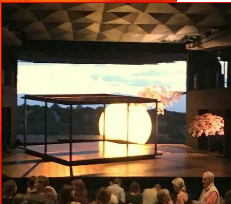
Opening scene of Madame Butterfly