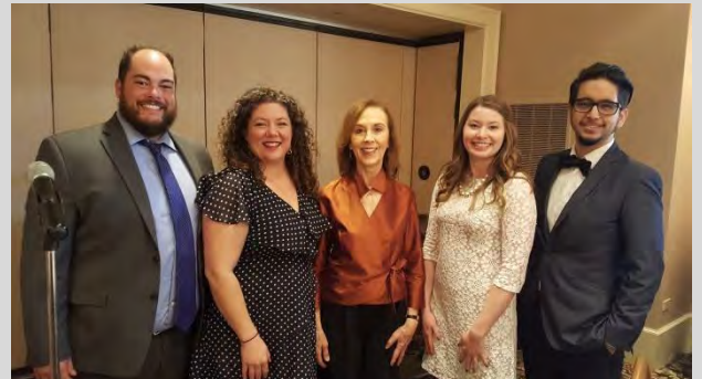
Lamont School of Music performers