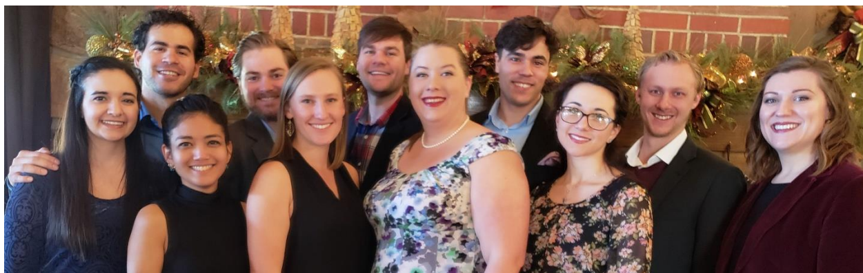
Eklund Opera, University of Colorado provided a delightful performance, including songs for the season.