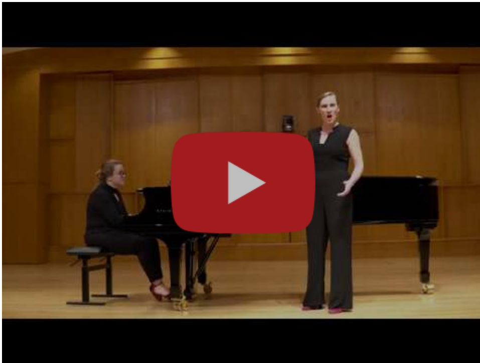
"Sta nel'ircana" from Handel's Alcina