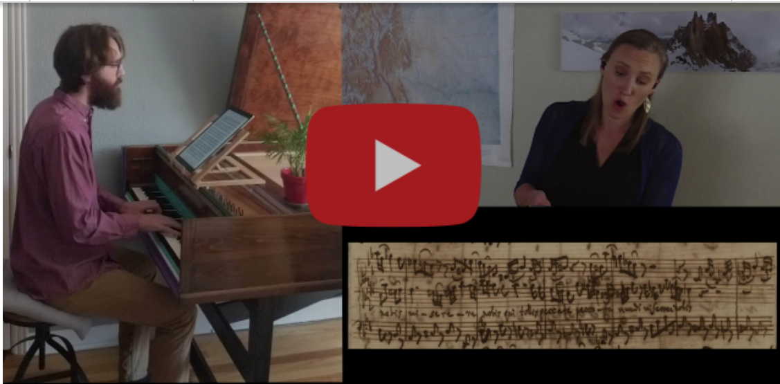
“Agnus Dei” from Bach’s Bminor Mass with the Boulder Bach Festival