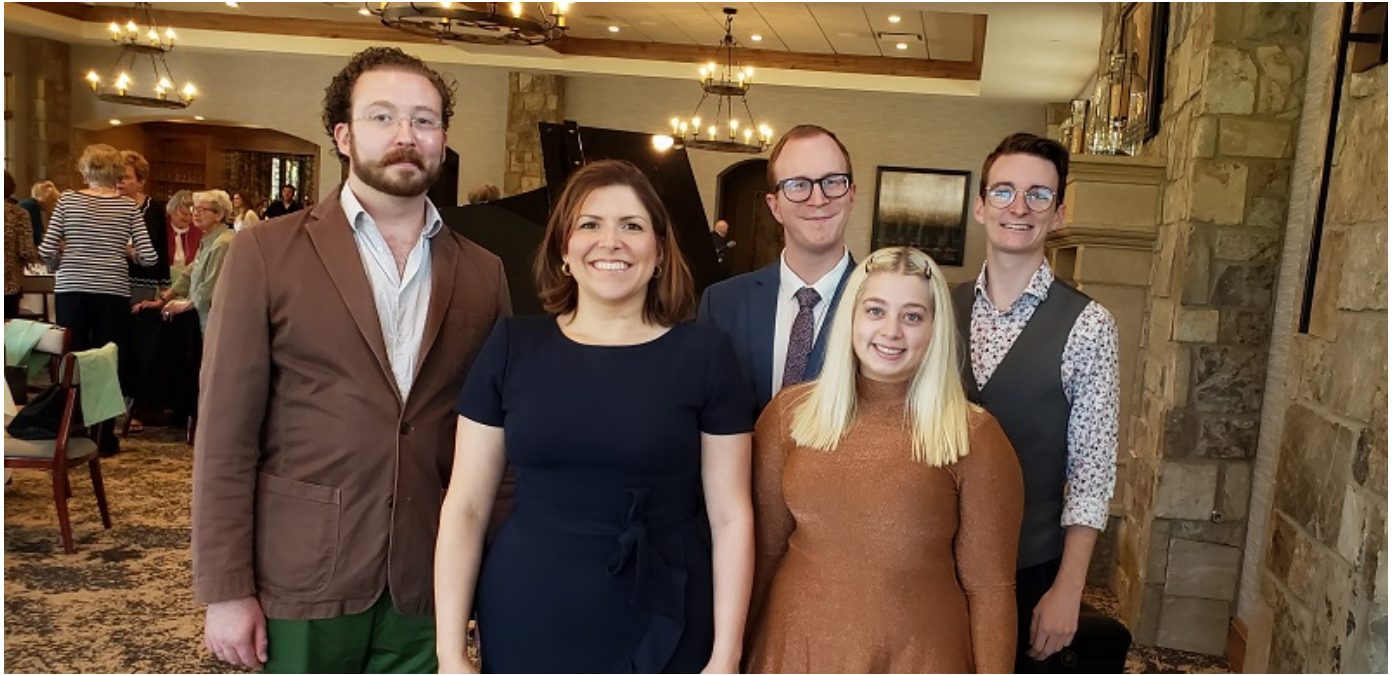
Bravi tutti, UNC Singers!!!