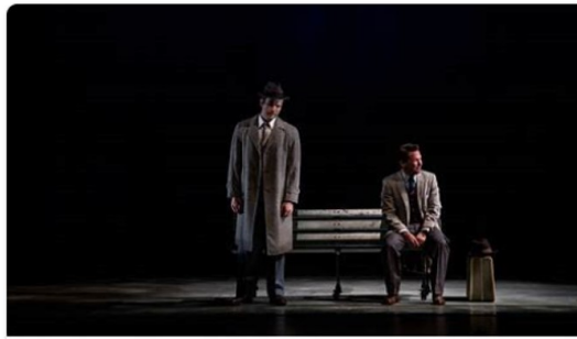
Review: Risk-Taking New Opera Tells a Tragic 1950s Gay Love Story - The New York Times