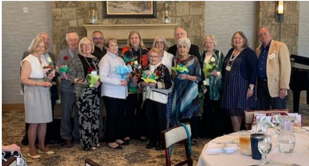
Thank you 2023-24 Board Members!!

To see more photos from this event, make sure to check out the DLOG Gallery.