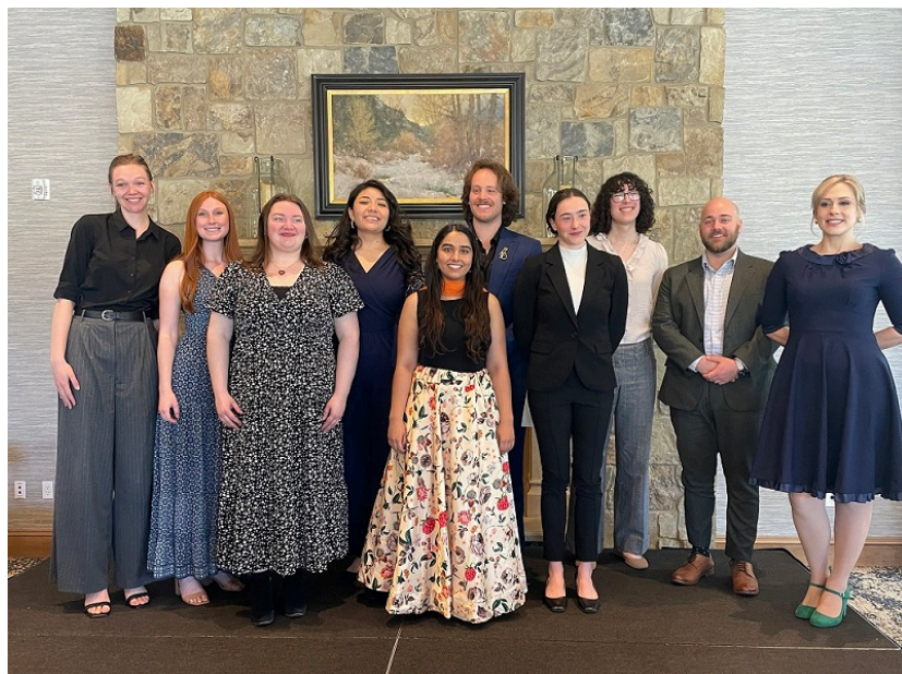
The 2026 Finalists at Opera on Tuesday